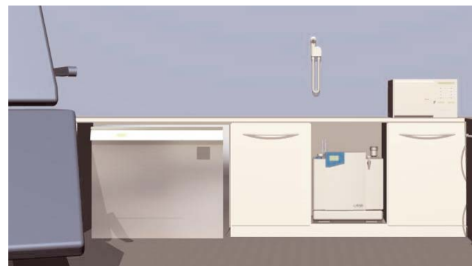
Fits easily into a conventional dental cabinet

Optional service and maintenance contracts to ensure maximum operational up-time and compliance with validation requirements.